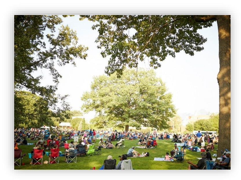
University Circle Inc.'s WOW: Wade Oval Wednesdays has received CAC funding since 2008.

These are general guidelines and are subject to change based on the total CAC funds available to the Project Support grant program in any given year. It is possible that all of the allocated Project Support grant funds could be awarded to those applicants receiving higher scores and applicants with lower scores (within the 75-100 point range) will not receive funding.