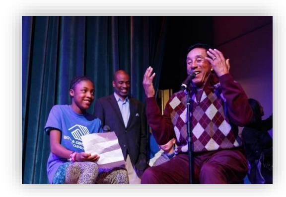
The Boys & Girls Clubs of Cleveland has been a Project Support I recipient since 2013.

The purpose of Cuyahoga Arts & Culture's Project Support (PS) grant program is to promote public access and encourage the breadth of arts and cultural programming in our community by supporting Cuyahoga County-based projects. Grant applications are reviewed annually through a public panel review process. CAC will offer two Project Support grant options in 2018 for projects occurring in the January 1 — December 31, 2019 grant period. This document provides the guidelines and application instructions for the Project Support I program.