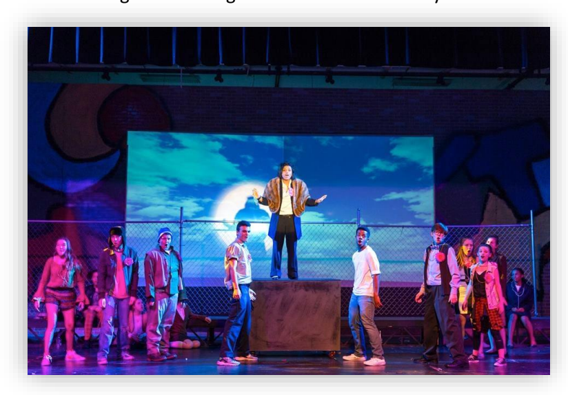
Heights Youth Theatre has received a Project Support I grant for the past three cycles.

A Cultural Partner not in good standing with CAC will be officially informed of this status in writing.